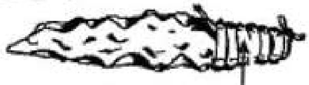
Blade Lashed to Hilt (Hardwood, Antler)